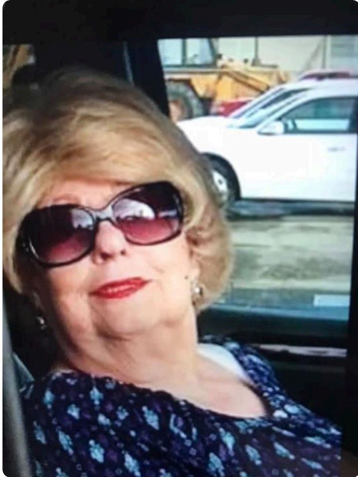
Mom ~ On our way to Chicks for dinner.