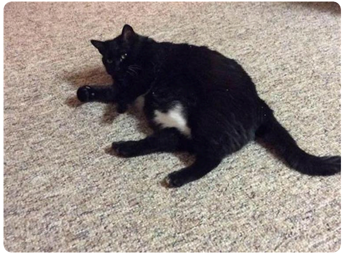
Bella Luce, the wild kitty with a heart on her tummy!