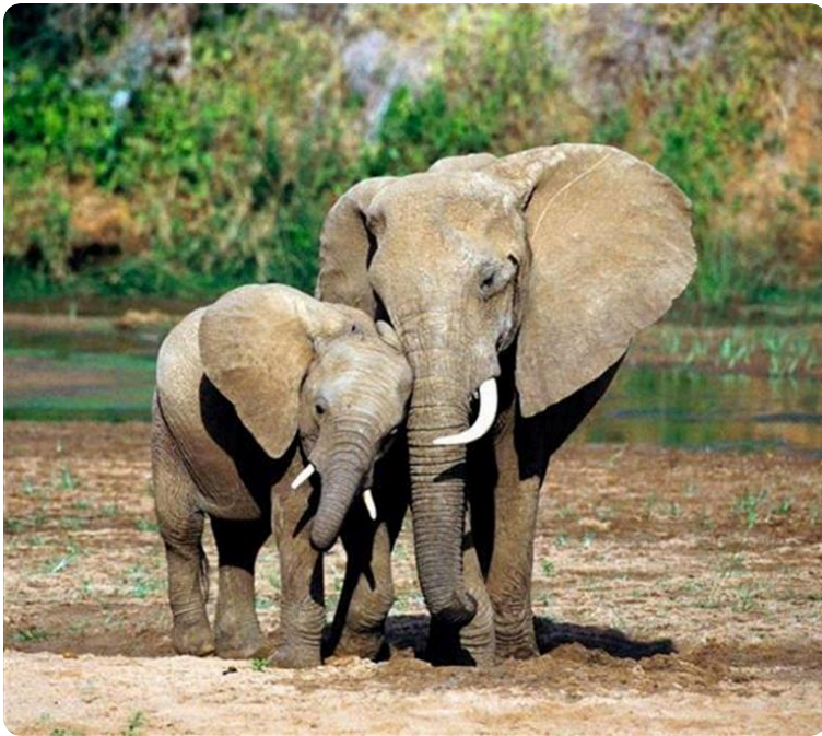
Mother elephants take very good care of their babies, just like mom did.