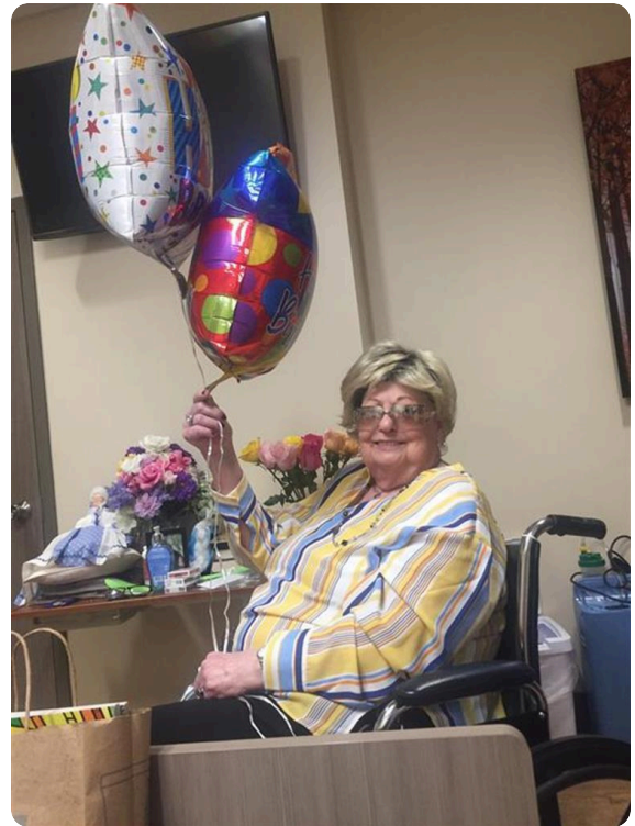
Always ready for a festive celebration!