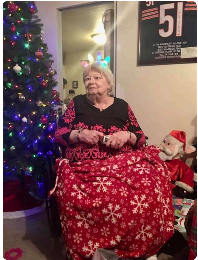
Christmas in Heber 2019 with family.