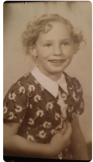
Mom as a young girl, maybe 7 or 8 y.o.?