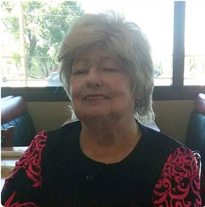
Dinner at Dees. She loved a great diner hamburger!