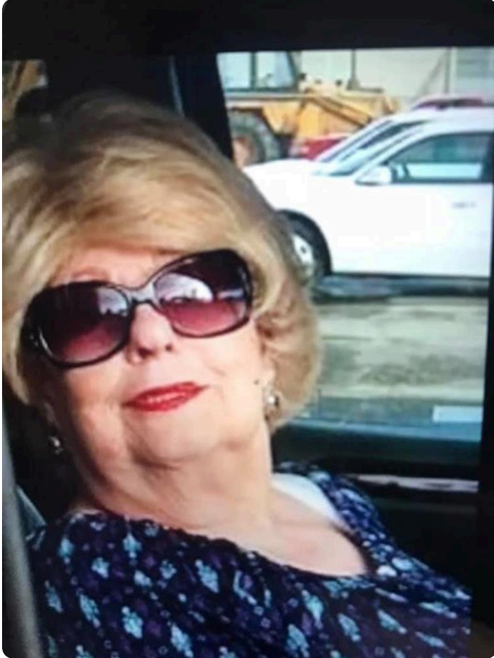
Mom ~ On our way to Chicks for dinner.