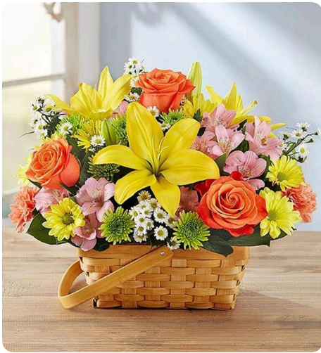
Flowers from family. She thought they were so beautiful.